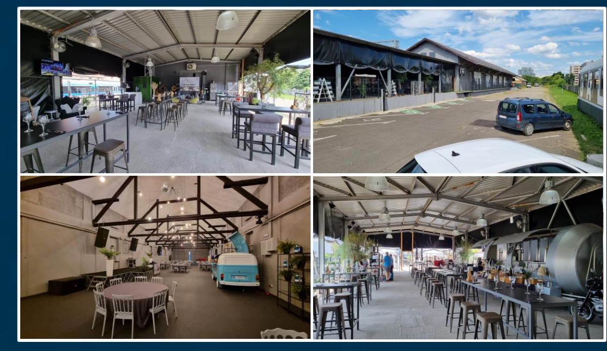
*At the event there will only be high tables of sponsors